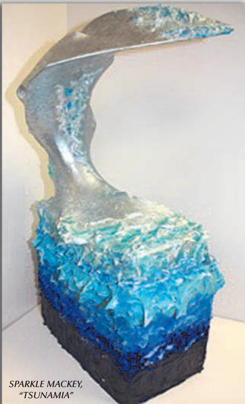
SPARKLE MACKEY, "TSUNAMIA"