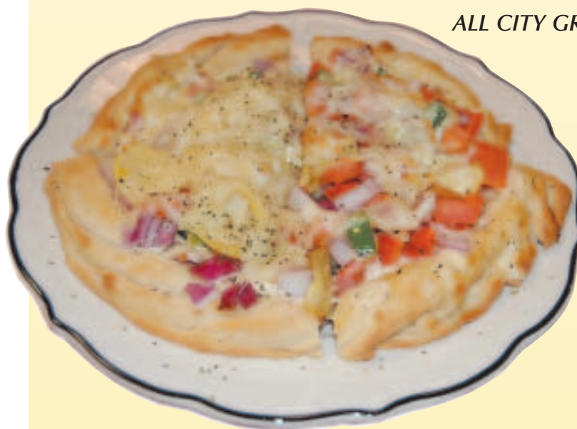
ALL CITY GRILLE'S VEGETABLE PIZZA