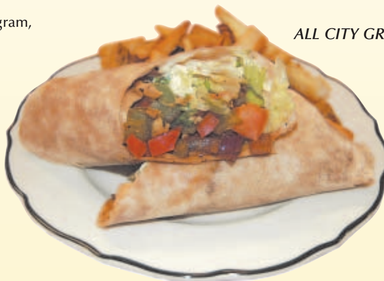
ALL CITY GRILLE'S WRAP