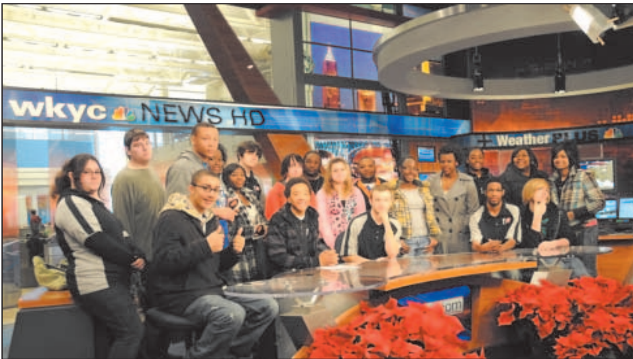
STUDENTS IN THE BROADCAST MEDIA PROGRAM RECENTLY EXPERIENCED ACTUAL ON-THE-JOB TRAINING, WHEN THEY VISITED WKYC TV CHANNEL 3 IN CLEVELAND.

★ Have you ever dreamed of being a news-caster, maybe create your own music video, run a camera, or perhaps be a TV reporter? If so, then Canton City Schools Broadcast Media program may be just for you. Students learn all aspects of creating a television program from behind the scenes production to the final product, which is the actual airing of the completed show. Students in the Broadcast Media program are responsible for most of the Canton City Schools TV Channel 11 programming. Students in the junior class produce the TV show In Focus which highlights special events and initiatives throughout the district while students in the senior class are responsible for the production and airing of Sports 101 . Sports 101 provide viewers with timely news and events focused around all areas of Stark County sports (both high school and college).