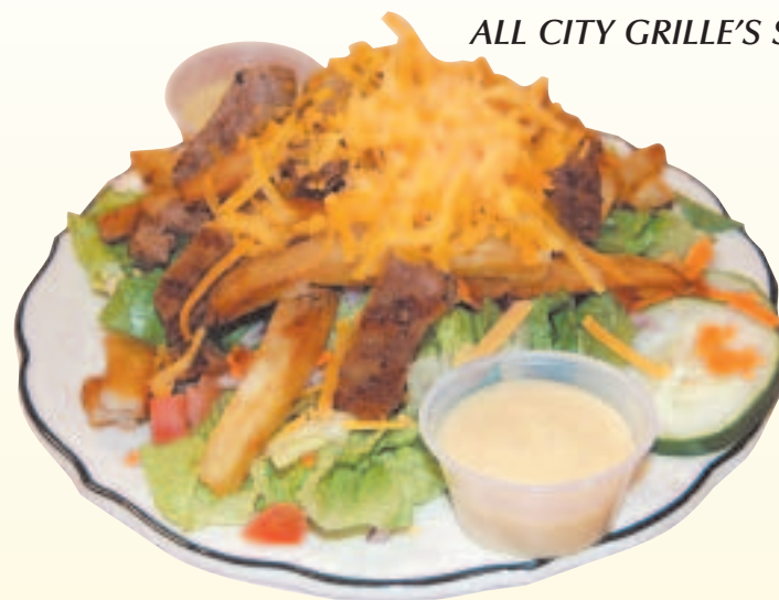
ALL CITY GRILLE'S STEAK SALAD